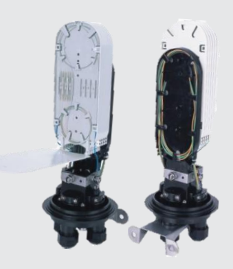
UF-30XXA cutaway view